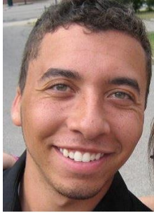
(Assistant Director/Associate Producer)